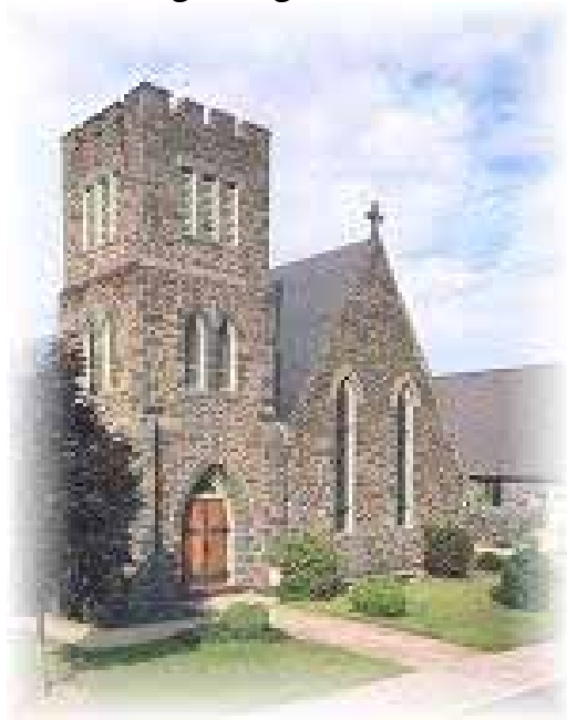
Grace Memorial Episcopal Lynchburg, Virginia